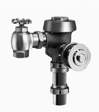
Variations Not Shown: 1" Straight Control Stop and Metal Oscillating Handle

Model ES flushometers are activated remotely by an electric push button (not included). "ES" flushometers offer solutions for installations that require automatic, remote or other control requirements