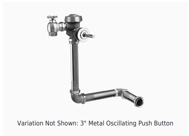
Variation Not Shown: 3" Metal Oscillating Push Button