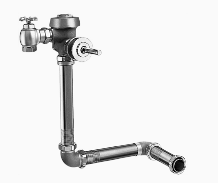
Variation Not Shown: Less Ground Joint