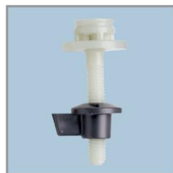
NON-CORROSIVE BOLTS AND WING NUTS