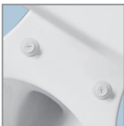
EASY REMOVAL OF SEAT FOR THOROUGH CLEANING