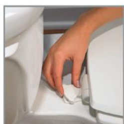
TWIST HINGES TO UNLOCK