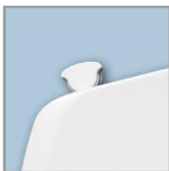
PLASTIC EASY RELEASE HINGES