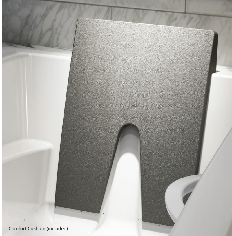
Comfort Cushion (included)